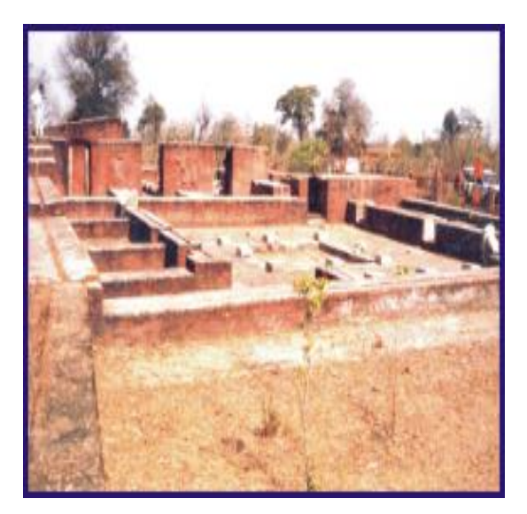
Fig: 2. Swastika Vihara

This monument is contemporary to Anand Prabhu Kuti Vihar at Sirpur situated at the distance of only 400 meters from the said monument. It is said that being in the shape of Swastika (a holy symbol) it was named as Swastika Vihar. A big sculpture of Lord Buddha is kept here in its sanctum. This beautiful Vihar was built just after the Anad Prbh Kuti Vihar in 7^{th} - 8^{th} cent. A. D. This is a brick built Buddhist monastery smaller than Anand Prabhu-Kuti.