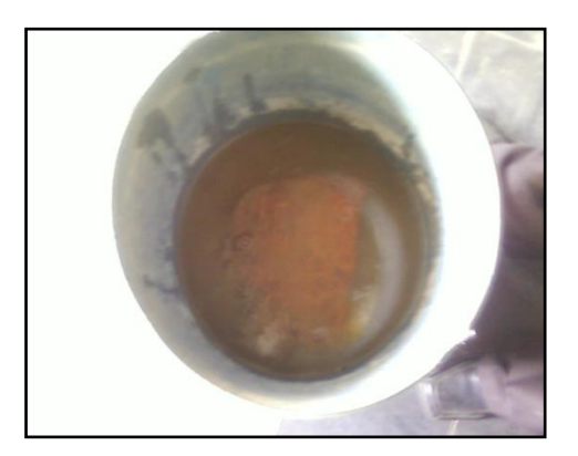
Fig: 5. Determination of water absorption