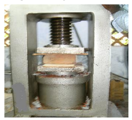
Fig: 4. Compressive Strength