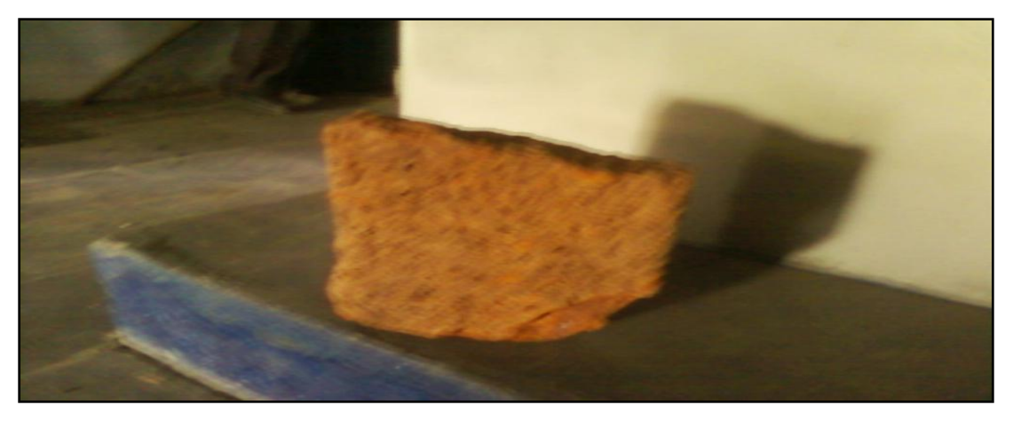
Fig: 6. Efflorescence

As per IS 1077:1992, the permissible value is 20%.by weight up to Class Designation 12.5 4.1.3. Efflorescence